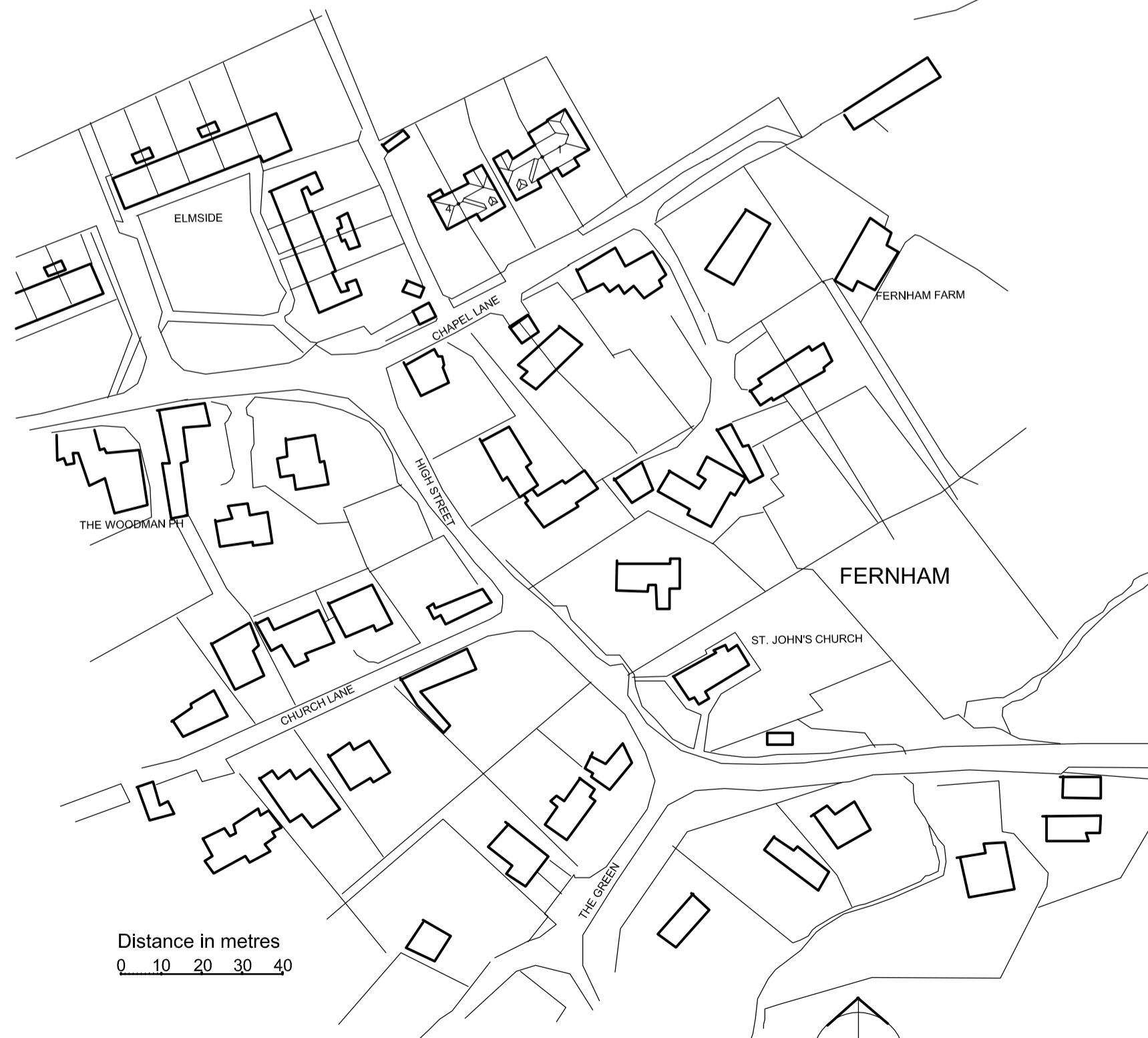
SITE LOCATION PLAN 1 : 1250 reproduced under OS license no. 100047860

rev A 15.12.14 car parking & associated boundary treatment altered